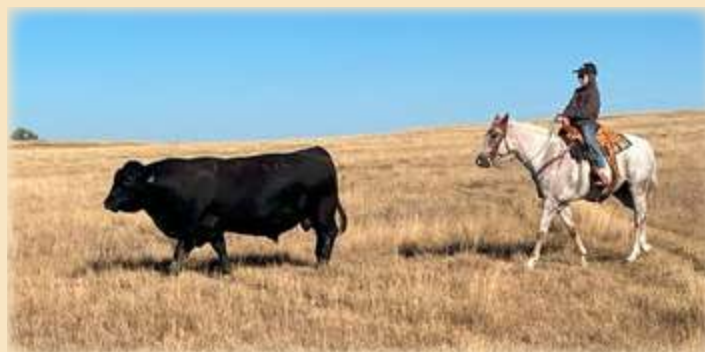
Cade trailing Big Country

Powerful, big middled, and expressively muscled, this Big Country ranks in the top 10% of the breed for claw, $M, and $W. His broody, high-volume dam has caught AI every year and has a calving interval of 4/367 and a WR of 4/105. His coming 12-year-old Confidence grand dam is another cow that epitomizes fertility and longevity, with a calving interval of 10/365, a BR of 9/92 and a WR of 9/101. She possesses excellent foot quality and has 4 daughters retained in the herd with a combined WR of 14/101. Her son sells as Lot 71.