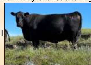
SAT Rachel 424 • Dam of Lot 81

The second of the Renovation x Motive sons. The 11-year-old dam to this bull has been a herd favorite for years, she is a cow that visitors and tour groups always find and ask about. Her picture has been used in our advertising for years. She is deep ribbed, easy doing, and combines power and femininity. She has a calving interval of 9/366 and has always passed on low birth weight with a BR of 9/93. With her background, I would feel comfortable using this bull on heifers.